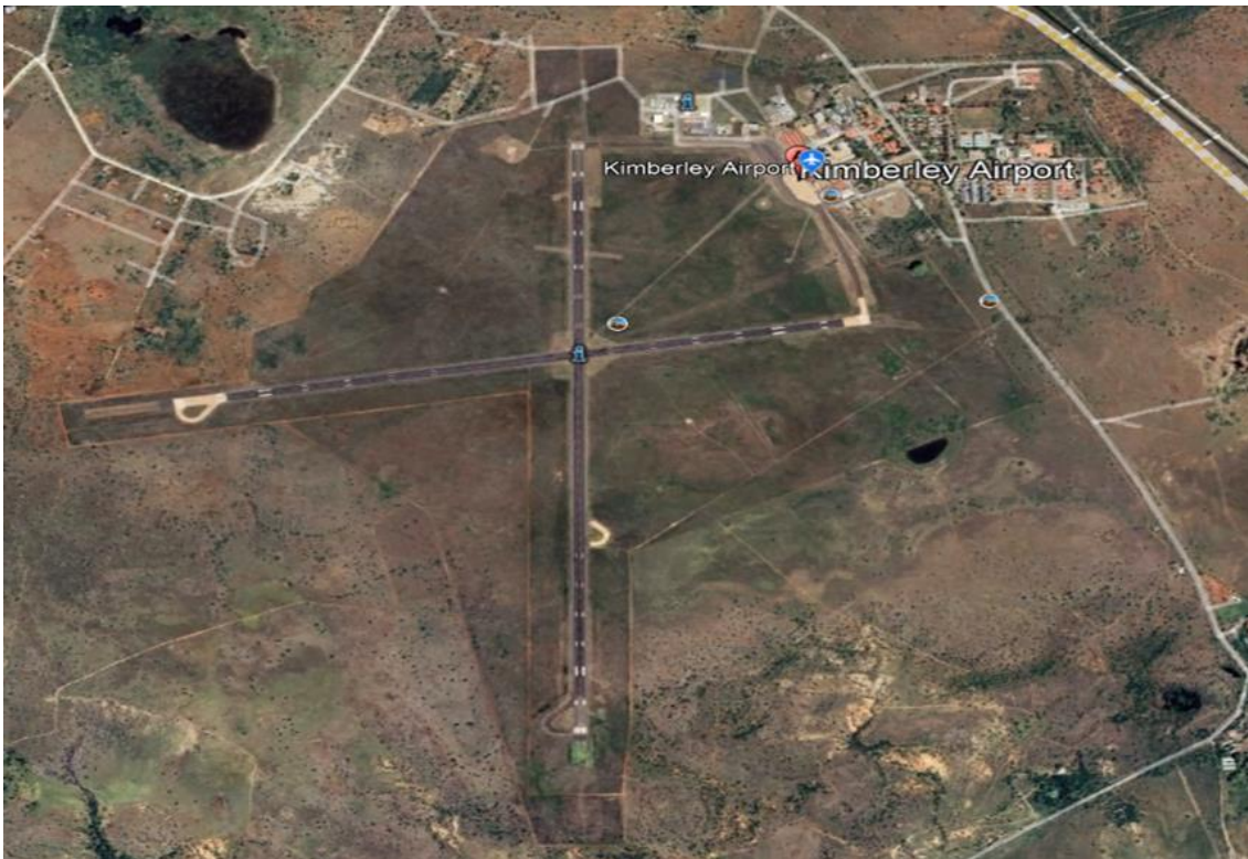
Figure 3.1: Aerial Image, Kimberley Airport.

The site of the works is Kimberley Airport. The works will be carried out on Landside and on restricted areas. Figure 2.5 below shows the airport layout. The access to restricted areas has stringent access control measures put in place. The Consultant is reminded that this is a National Key Point and as such must adhere to all airport's rules and regulations regarding health and safety, environmental, security, fire and access control.